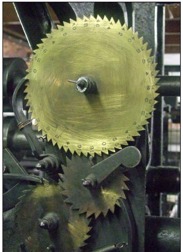
Amphitheater of Termessos, Turkey