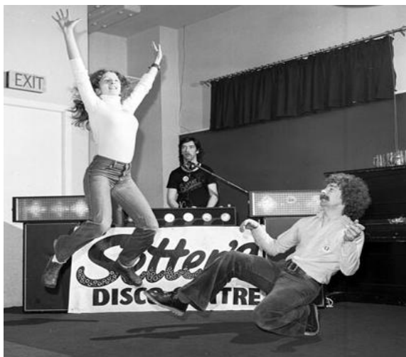
Disco Marathon 1979