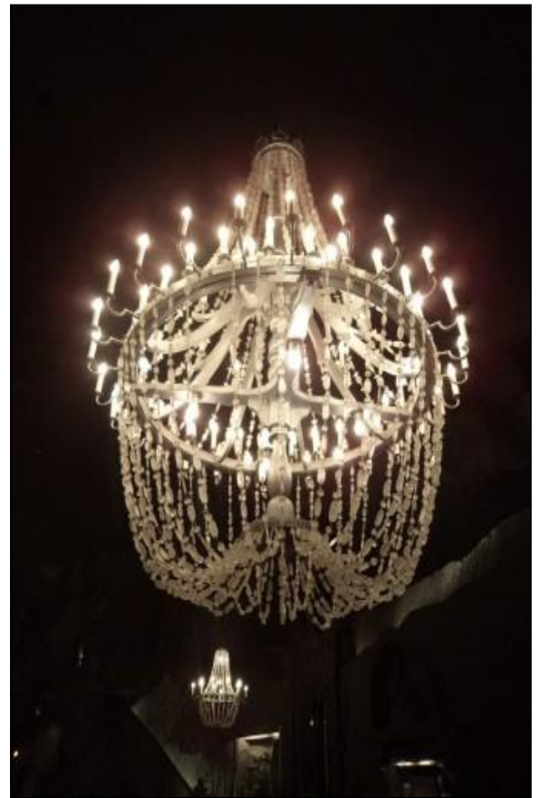
Light Fitting in Wieliczka Salt Mine, Poland

http://www.scran.ac.uk/database/results.php?QUICKSEARCH=1&search_term=Termessos