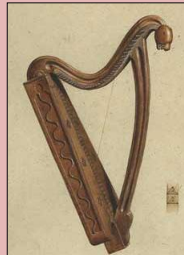
Irish Harp by James Drummond

All this content is copyright-cleared for educational use, personal podcasting or multimedia projects. Download them, reuse in Apple's Garageband, Adobe Premiere, Apple Final Cut Express or iMovie, or any third-party software where you need instrumental music. Feel free to adapt, expand or edit!