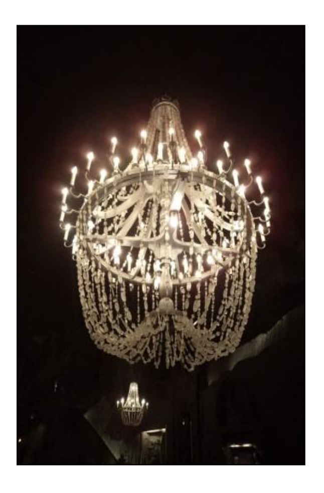
Light Fitting in Wieliczka Salt Mine, Poland Brass Dial on a Nottingham Lace Machine Amphitheater of Termessos, Turkey