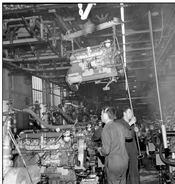
Leyland factory 1969