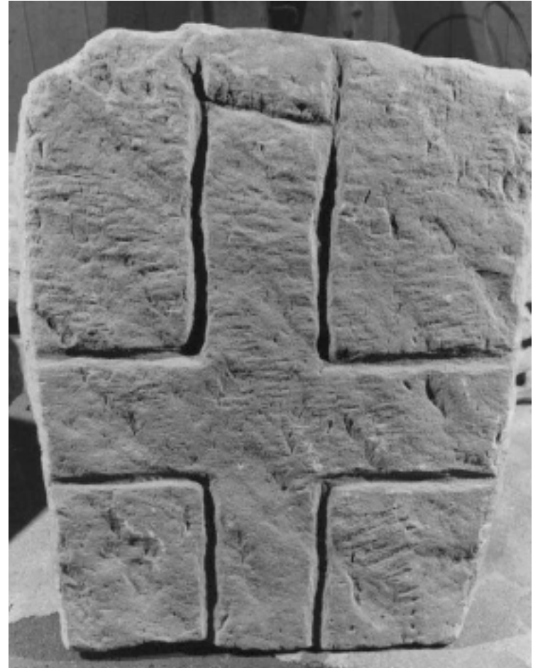
Incised cross-slab, Abercorn Church, West Lothian