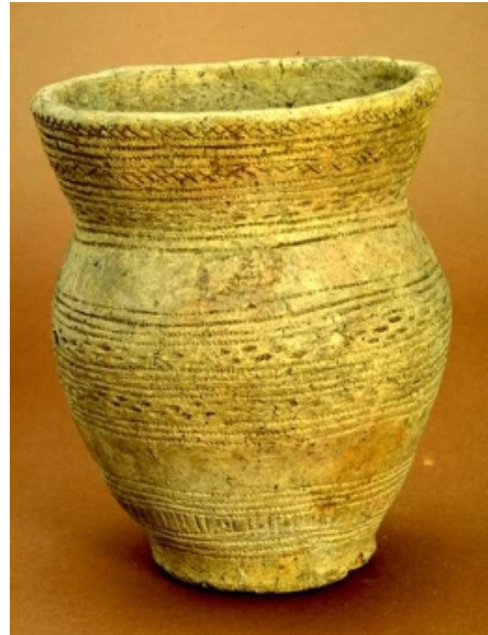
Bronze Age beaker, Parkhill, Newmachar, Aberdeenshire H: 178 mm Dia(rim): 142 mm SCRAN ID: 000-000-142-556-R