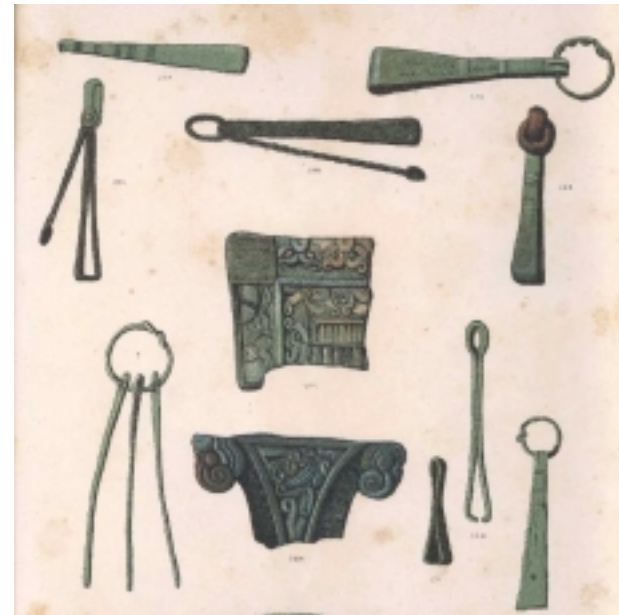
Tweezers and brooch fragments Little Wilbraham, Cambridgeshire Drawings and lithography by Samuel Stanesby From Neville's Saxon Obsequies Illustrated (1852), Plate 23